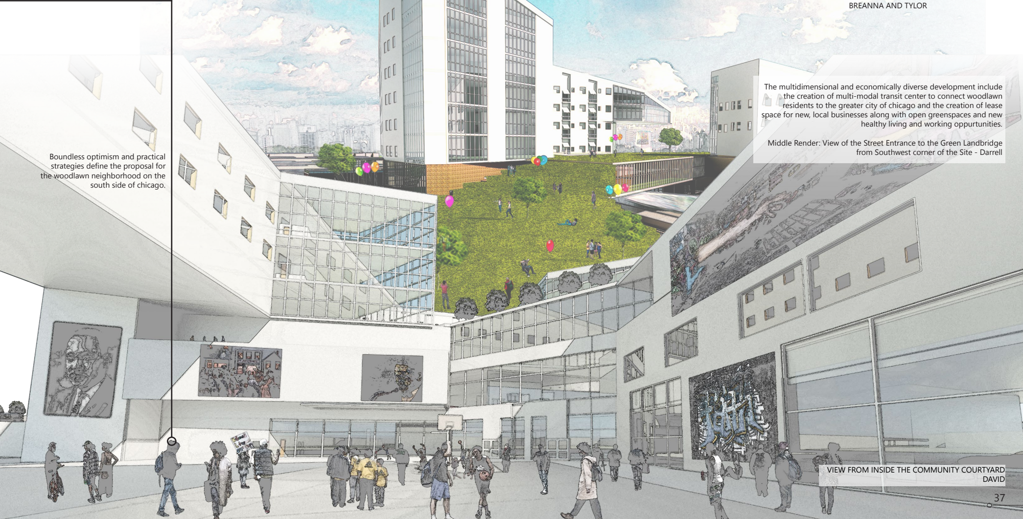
GROUND BREANNA AND TYLOR

Boundless optimism and practical strategies define the proposal for the woodlawn neighborhood on the south side of chicago.